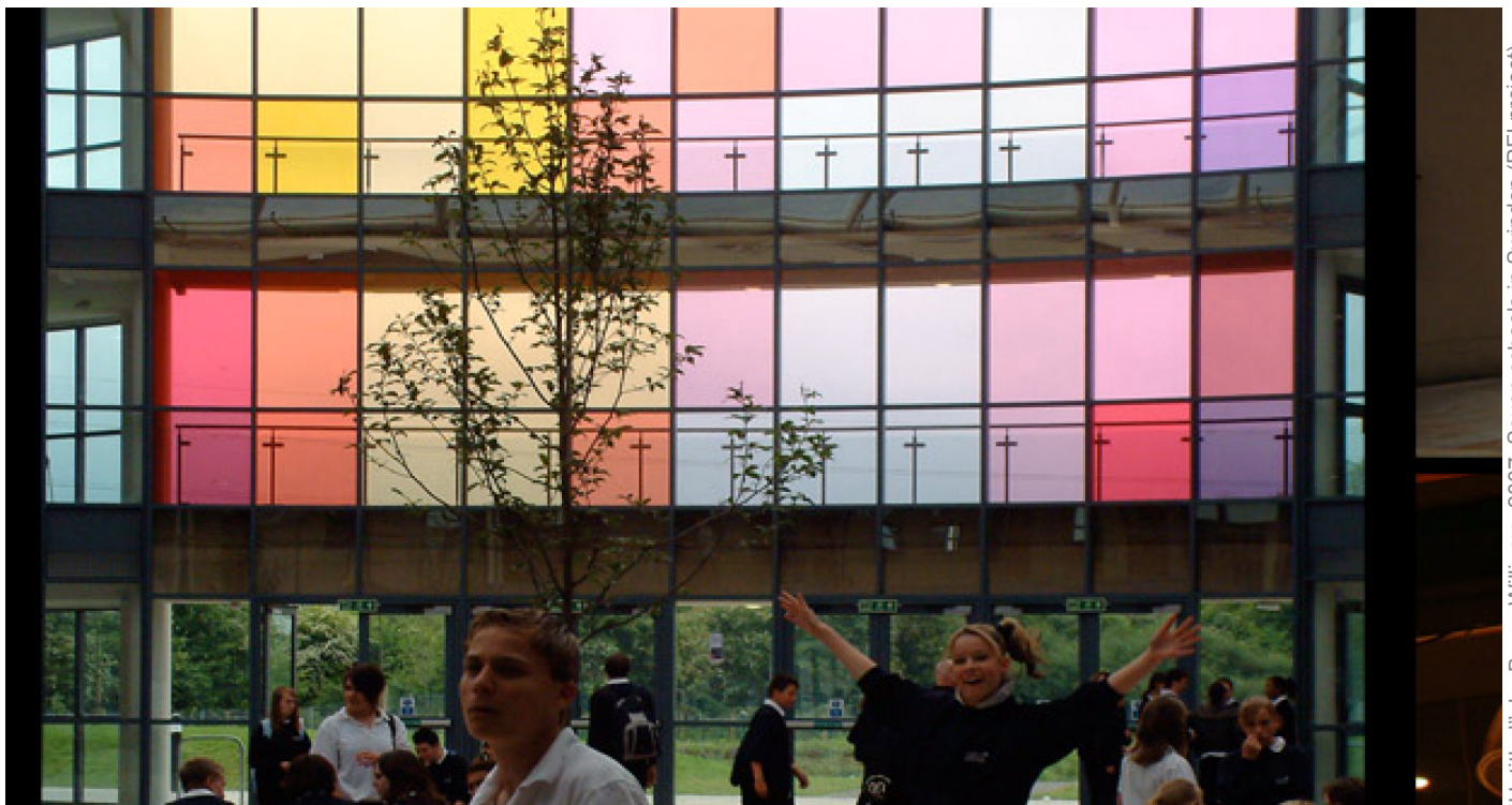
'Untitled', by Bruce Williams, 2007. Seven schools in Swindon (PFI project) Laminated glass with translucent coloured interlays.