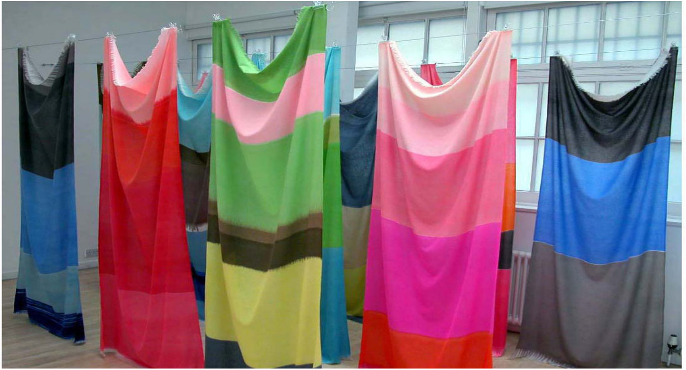
'Untitled', installation by Kate Blee. Exhibition Contemporary Applied Arts. Cashmere reactive dye.