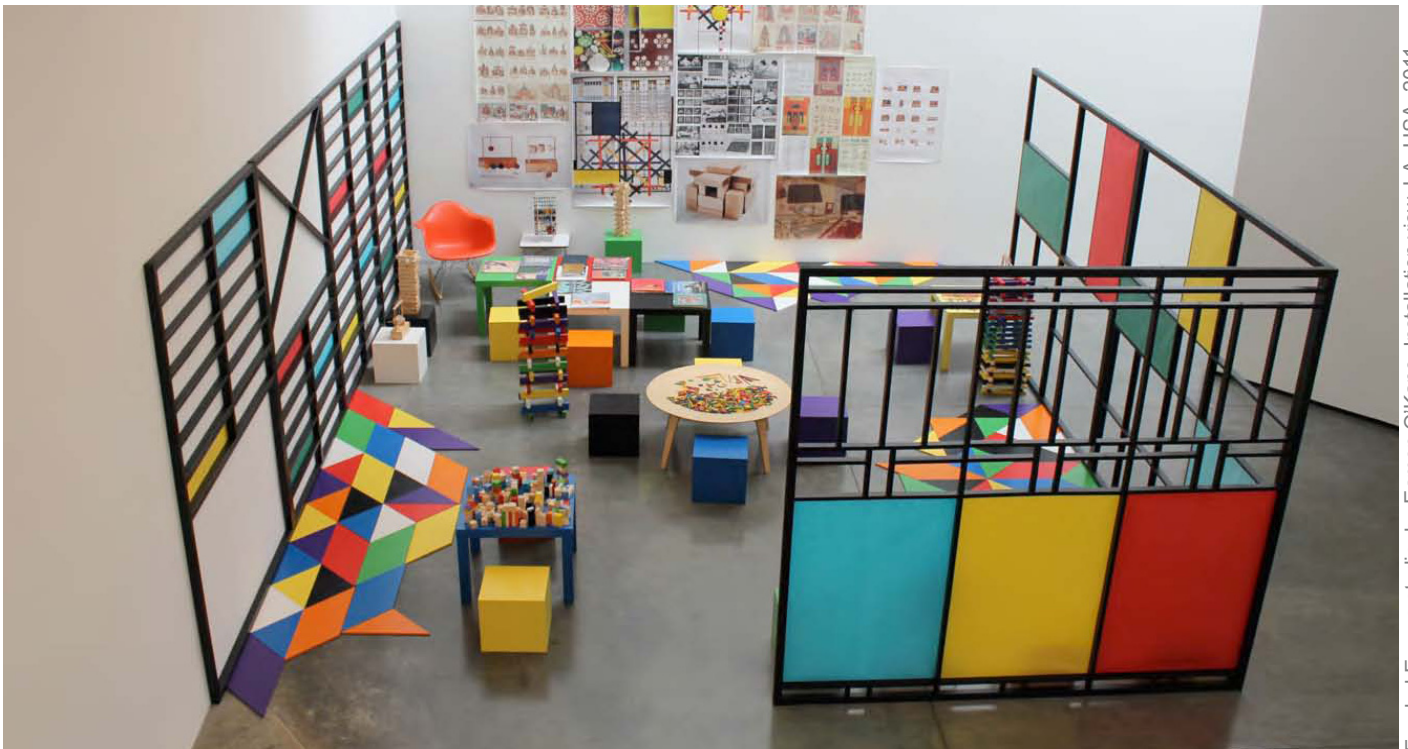
Froebel Eames studio, by Eamon O'Kane. Installation view, LA, USA, 2011.